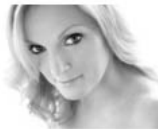
Rhonda Vincent - Friday