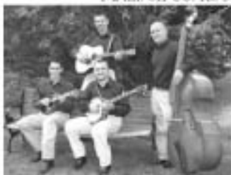
Surefire - Saturday