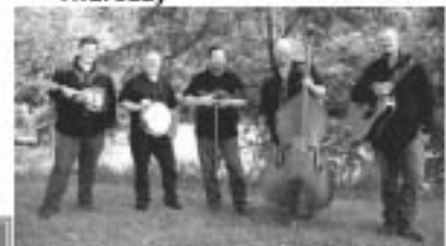
Bluegrass Brothers - Saturday