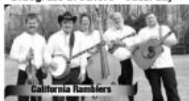
California Ramblers - Friday