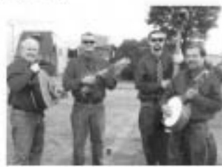
Country Poor - Thursday