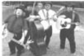
Country Fried Grass - Friday