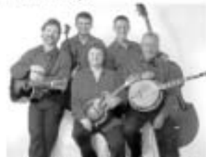
Carolina Road - Friday